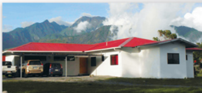
OSOP Headquarters in Panama

We envision a world of cheap, ubiquitous seismic sensors, fully automated local monitoring systems, and tightly integrated hardware and software solutions. In our world, your seismic observatory or civil defense office is connected to the public through social media and information is disseminated effortlessly.